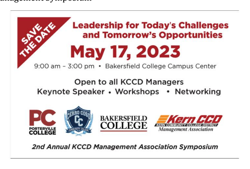
May 17th: Management Symposium