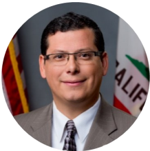
Rudy Salas California State Assembly

On April 13, I was pleased to host 252 attendees for a virtual seminar with political and community leaders who updated BC faculty, staff, and students on local and statewide budgetary issues, how BC can assist local businesses in skilling up furloughed employees or those who have been laid off, and the role of the community college in supporting economic stability and positioning individuals for success during this uncertain time.