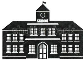
5 Feeder High Schools

Porterville College works within its Kern and Tulare County service area to provide quality academic programs, comprehensive support services with students as our focus. PC has five (5) feeder high schools with over 70% of student enrollment coming from within the service area.