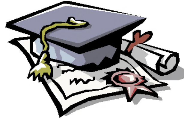
Statewide Transfer Rate by Degree 2015-16