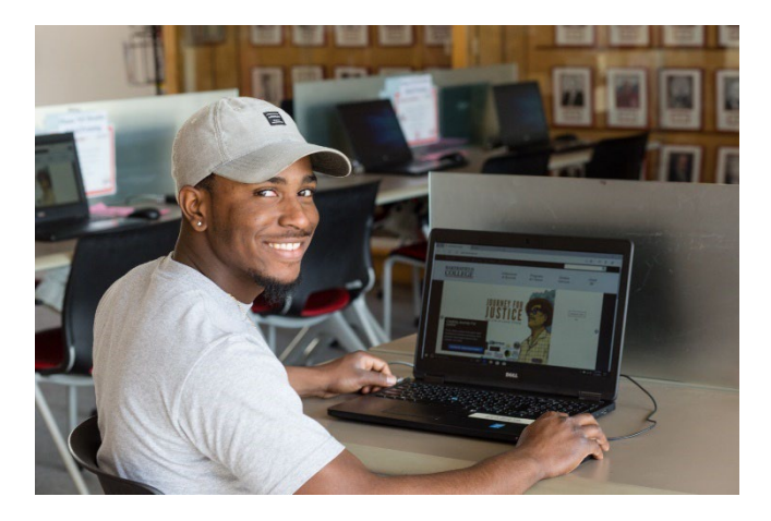
Bakersfield College Educational Master Plan | Page 24

Leadership and staff in BC's Office of Student Life are dedicated to ensuring learning through the opportunities they provide students both inside and outside of the