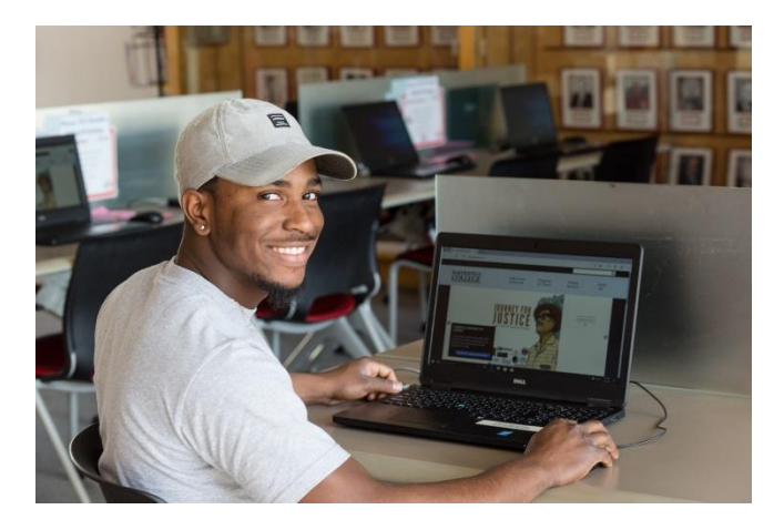
Bakersfield College Educational Master Plan | Page 24

Leadership and staff in BC's Office of Student Life are dedicated to ensuring learning through the opportunities they provide students both inside and outside of the