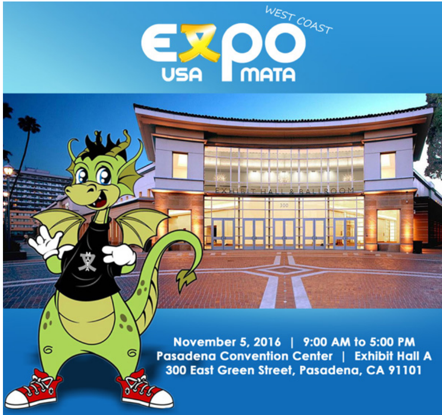
2016 MATA EXPO USA at WEST Coast (Pasadena, CA - November 5)

HOME GET A BOOTH BUY TICKETS NOW CONTACT US