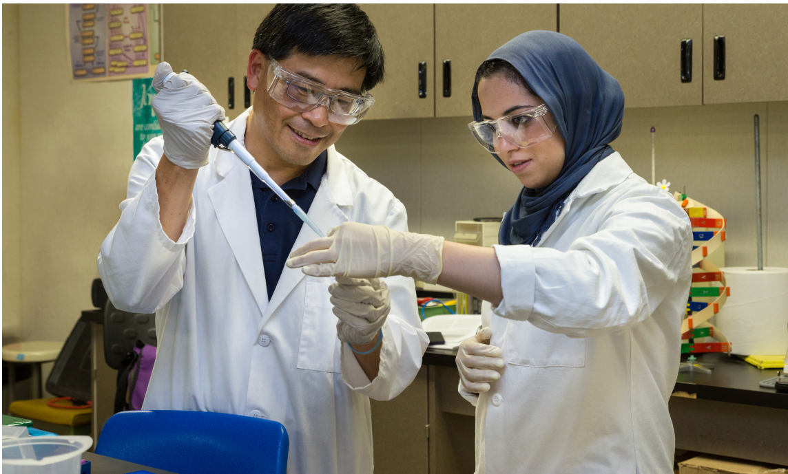
An American River College student and her instructor in the lab.

In May 2009, the California Community Colleges Board of Governors approved changes to California Code of Regulations, title 5, §53407 and §53410 to allow the creation of a third option within the minimum qualifications to be defined requiring a bachelor's or associate degree in a specific discipline, plus requisite years of professional experience. The four types of discipline lists contained in this handbook are identified on the opposite page.